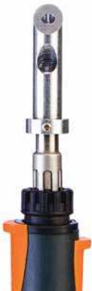
Plastic welding tip