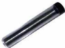
Solder Tube 1mm