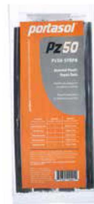
Pz50 Starter Pack (assorted plastic repair rods)