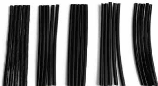
Plastic Welding Rods (25 per pack)