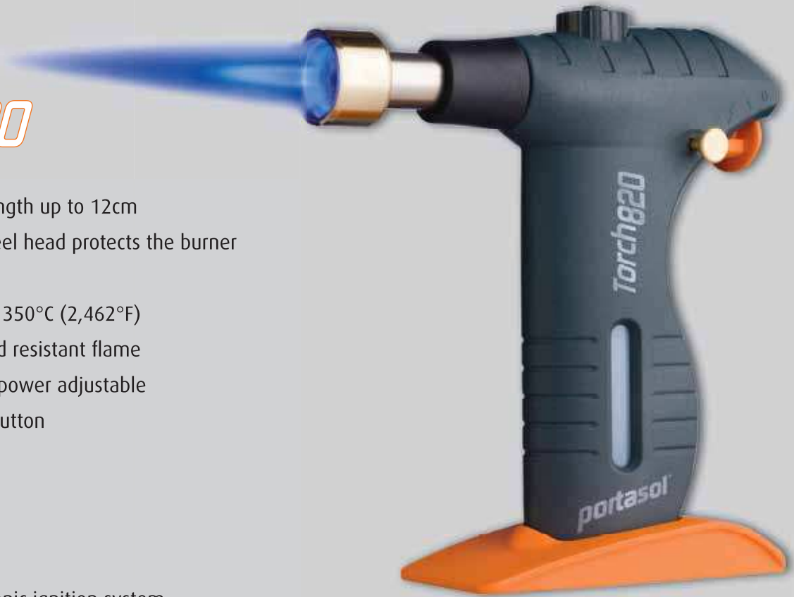
Jet assembly Torch 820