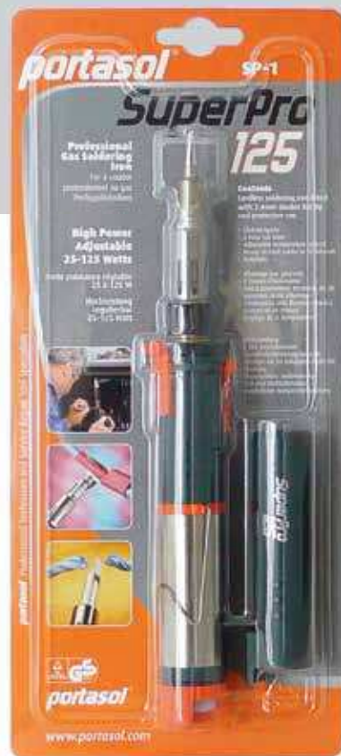
Single: Model # SP-1

A selection of soldering spare tips and parts