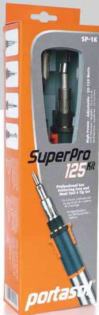
Kit: Model # SP-1K

Anti-static / ESD safe, this tool will be a versatile addition to your toolbox.