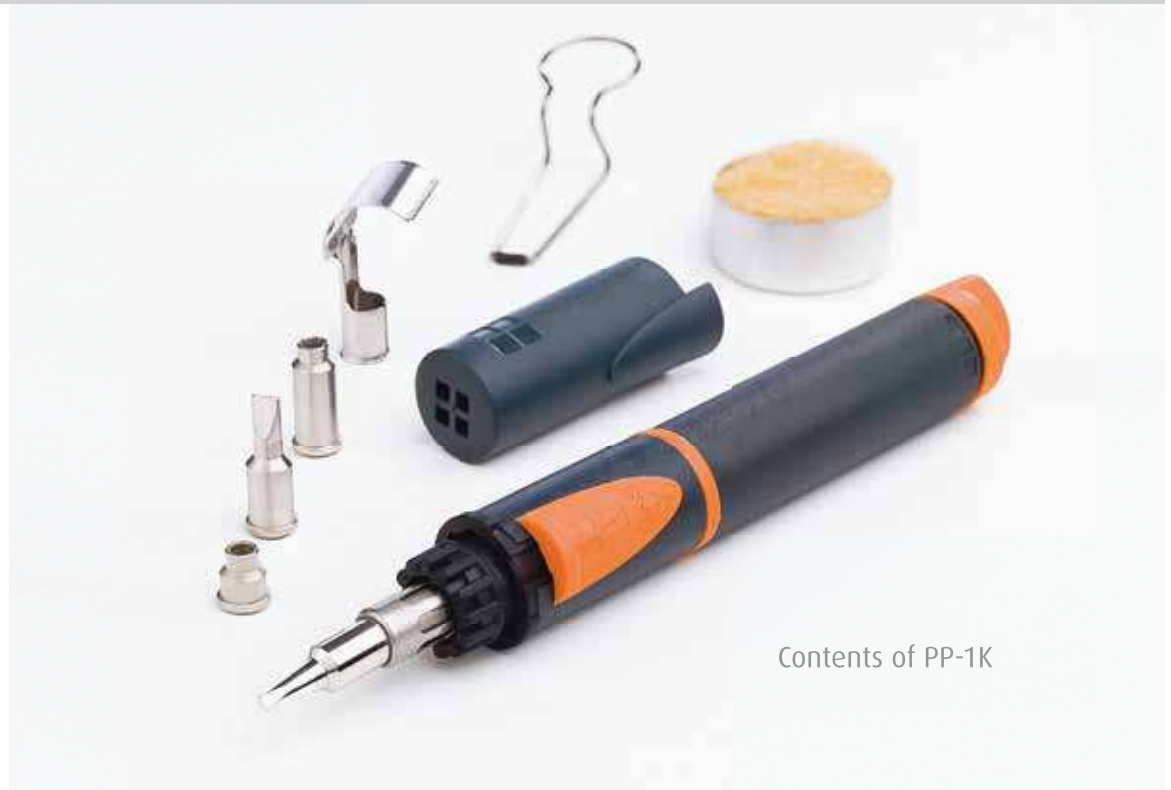
Contents of PP-1K