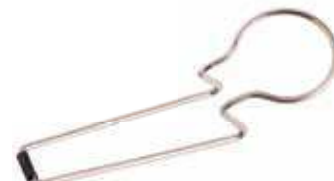
P50T-8 Extra Wire Stand