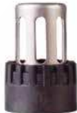
SPT-18 Retainer Tube Collet