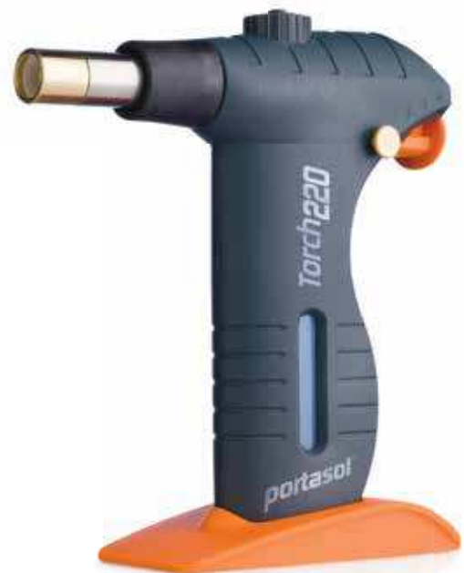
Model # GT220