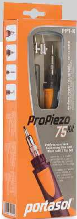
Kit: Model # PP-1K