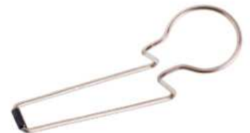
P50T-8 Extra Wire Stand