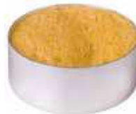
P50T-9 Sponge & Tray