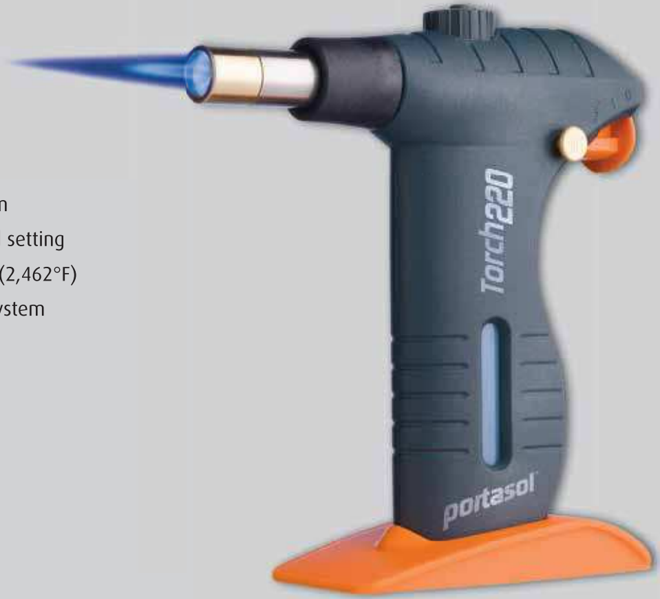
Jet assembly Torch 220