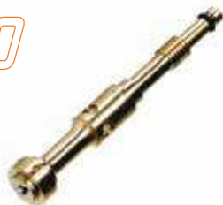
HP820-1 Jet Assembly