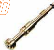
GT220-1 Jet Assembly