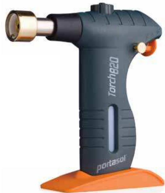
Model # HP820