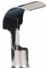
PPT-13 Hot Air & Deflector