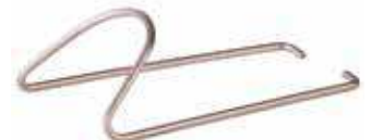
SPT-15 Wire Stand