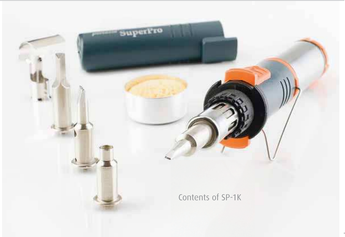
Contents of SP-1K