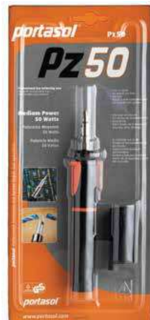
Pz50 Soldering iron fitted with: Tip Body, 1mm Tiptet, 2.4mm DF Tiptet, 3.2mm DF Tiptet, 4.8 mm DF Tiptet, Hot Knife Tiptet & Instructions