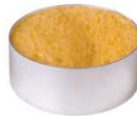
P50T-9 Sponge & Tray