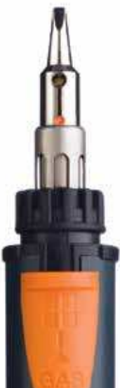
ProPiezo 75 with 2.4mm df tip

ProPiezo 75 fitted with: 2.4mm df tip, hot air blower & deflector, hot knife, flame tip, cleaning sponge, stand, storage case and instructions.