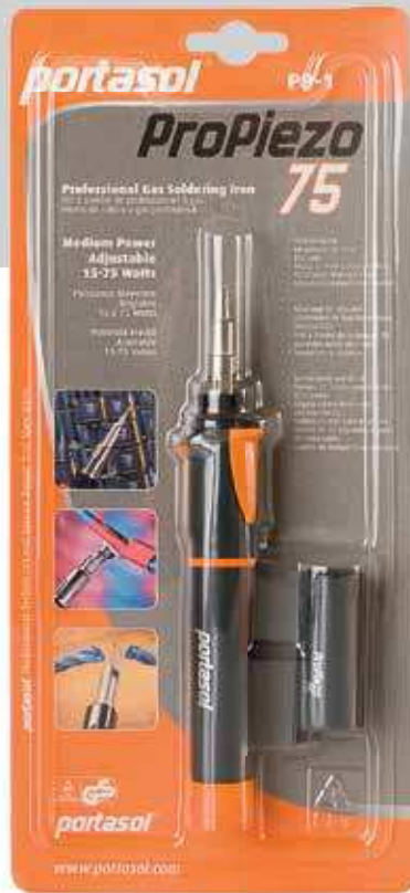
Single: Model # PP-1

A selection of soldering spare tips and parts